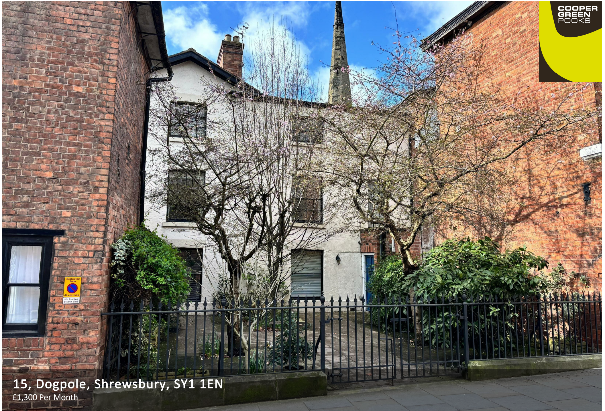
15, Dogpole, Shrewsbury, SY1 1EN £1,300 Per Month