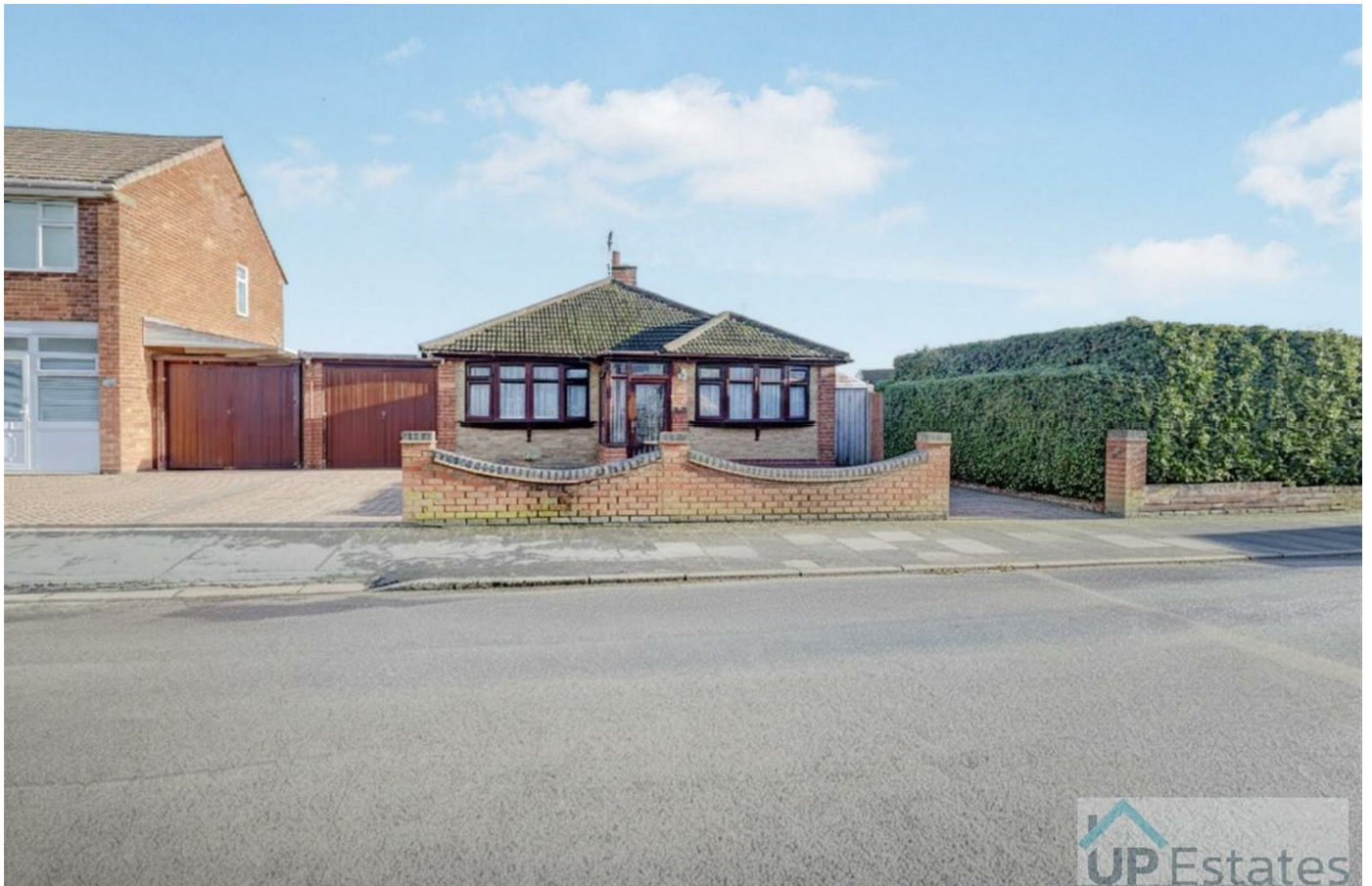
Peake Avenue, Nuneaton