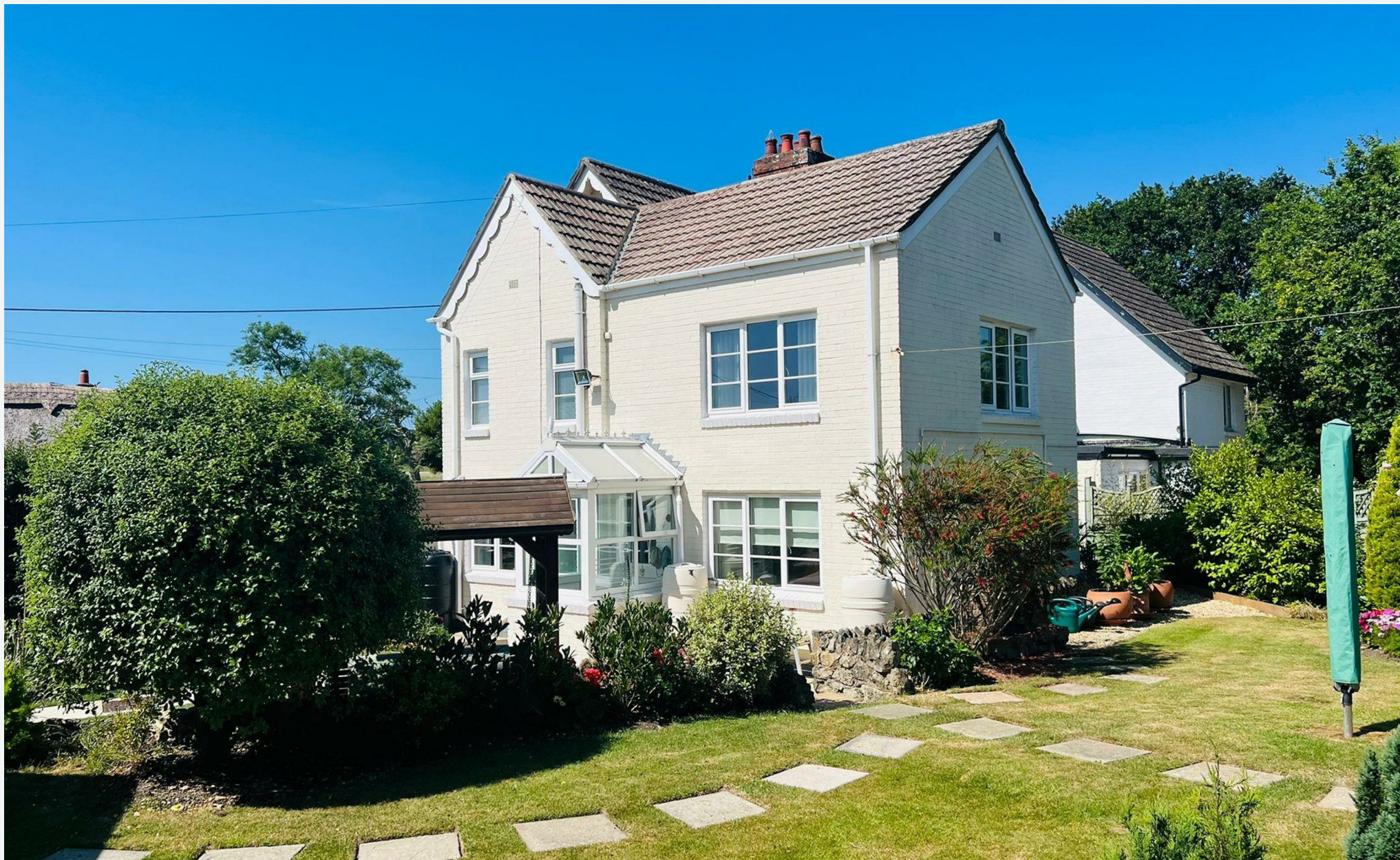
1 West Hill Cottages, Ningwood, Isle of Wight