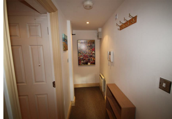
Apartment Entrance/ Hallway