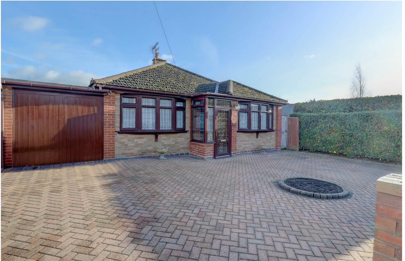
Peake Avenue, Nuneaton