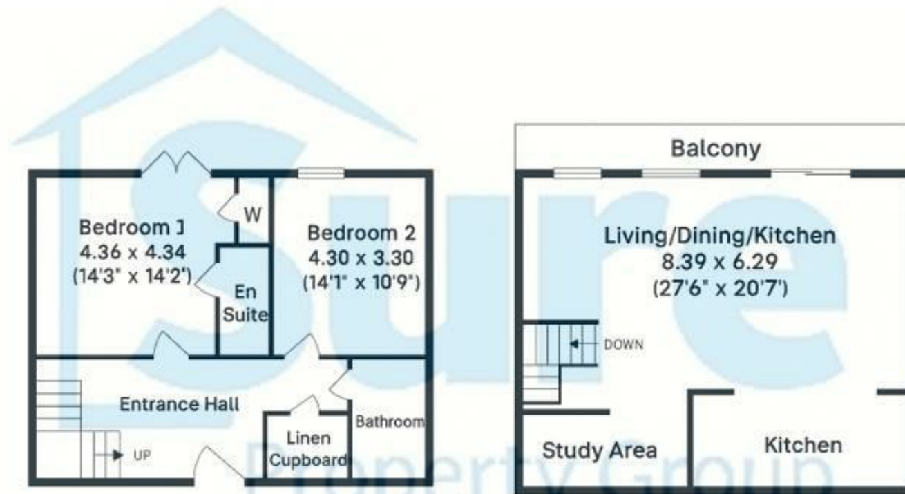
Floorplan for guidance only – not to scale

Enviably located at Gloucester Docks for this spacious TWO DOUBLE BEDROOM penthouse apartment located on the third and fourth floor of this purpose built block which is accessed via lift or stairs.