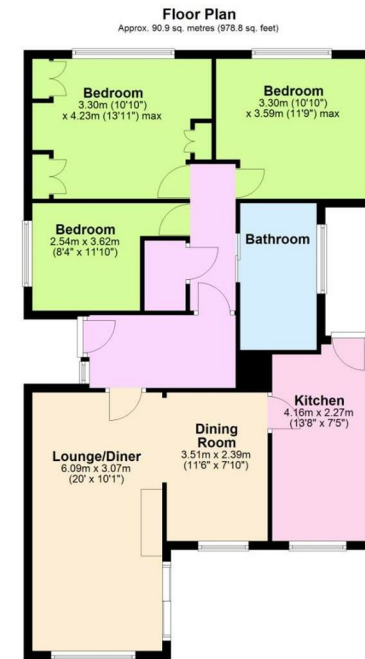
Total area: approx. 90.9 sq. metres (978.8 sq. feet)