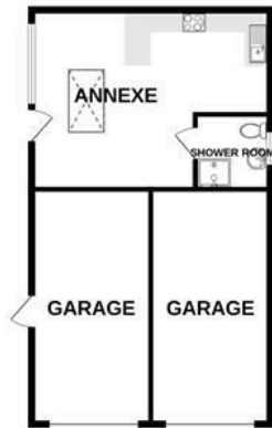
GROUND FLOOR 1420 sq.ft. (132.6 sq.m.) approx.