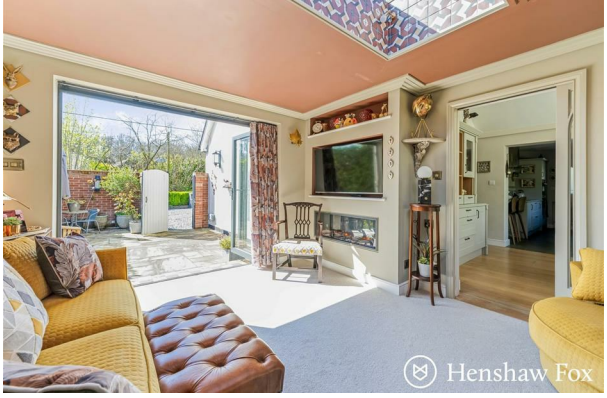
Rose Cottage | £775,000 Church Lane, Awbridge, Hampshire, SO51 0HN