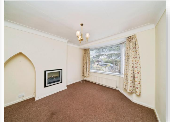
Bentfield Gardens, Wirral, CH63 8NA