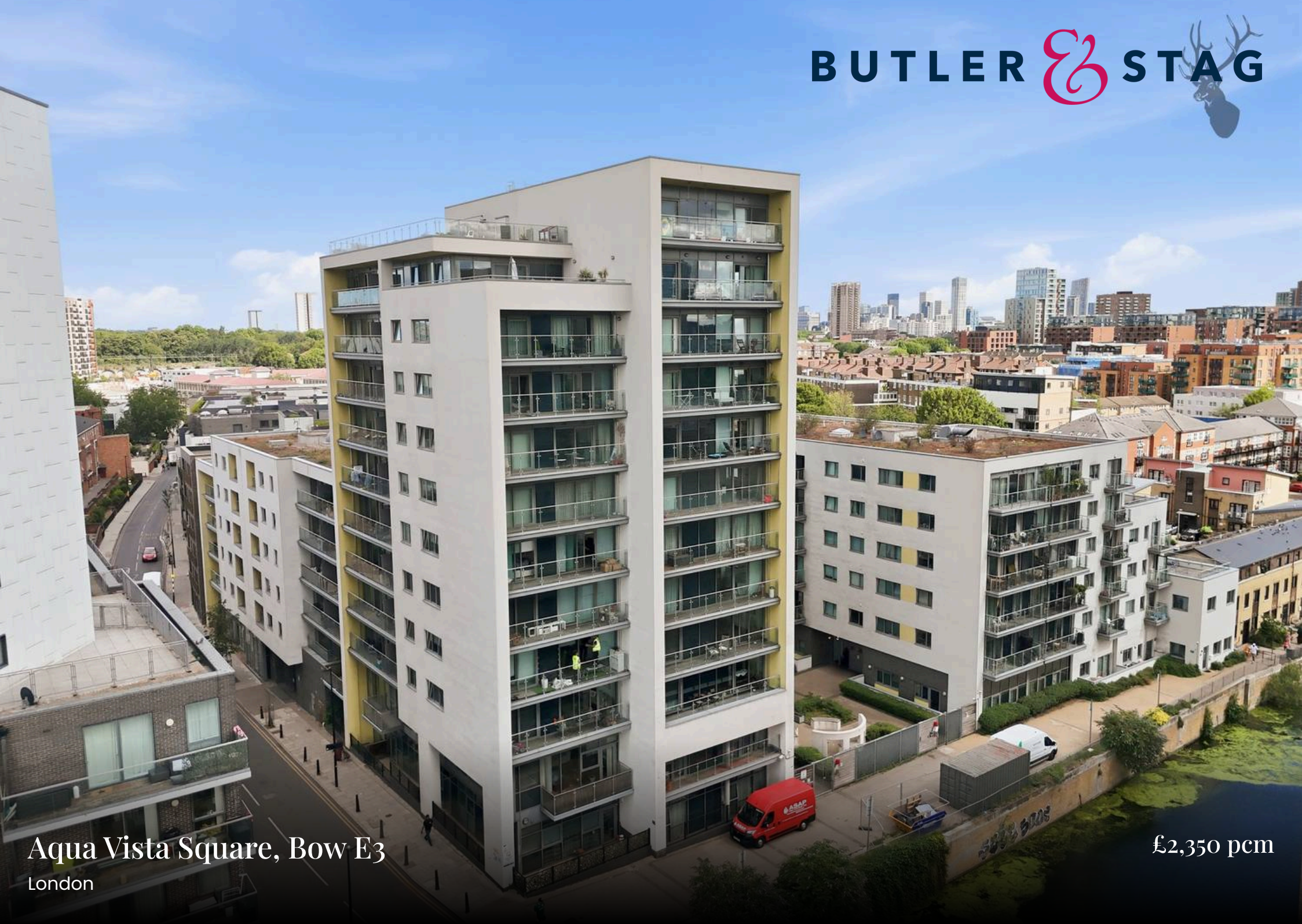
Aqua Vista Square, Bow E3 London