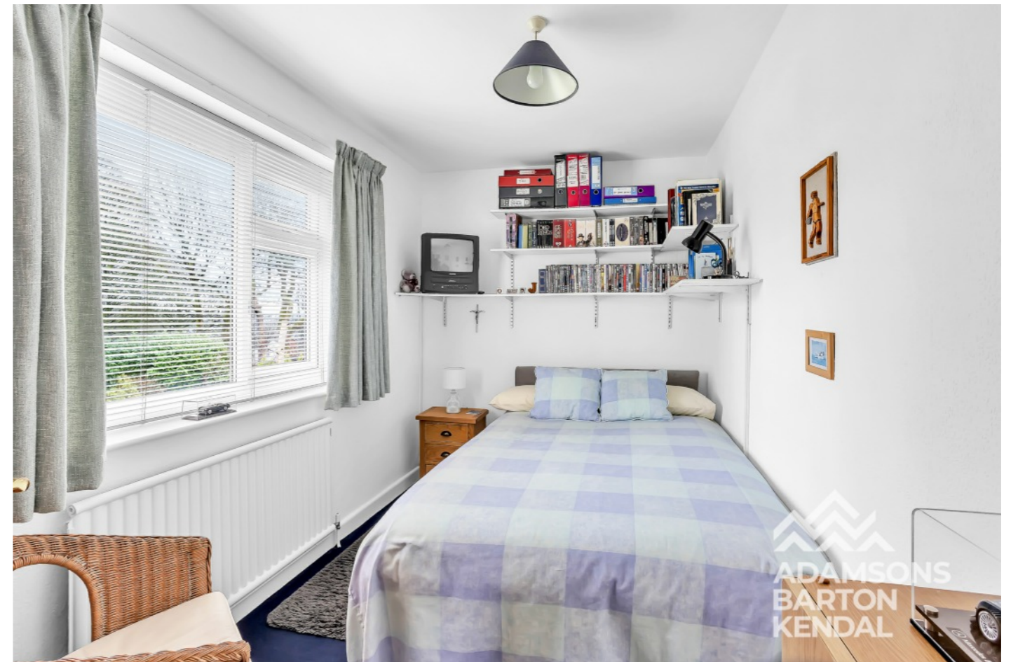
Newhouse Crescent, Norden, Rochdale OL11 5RR