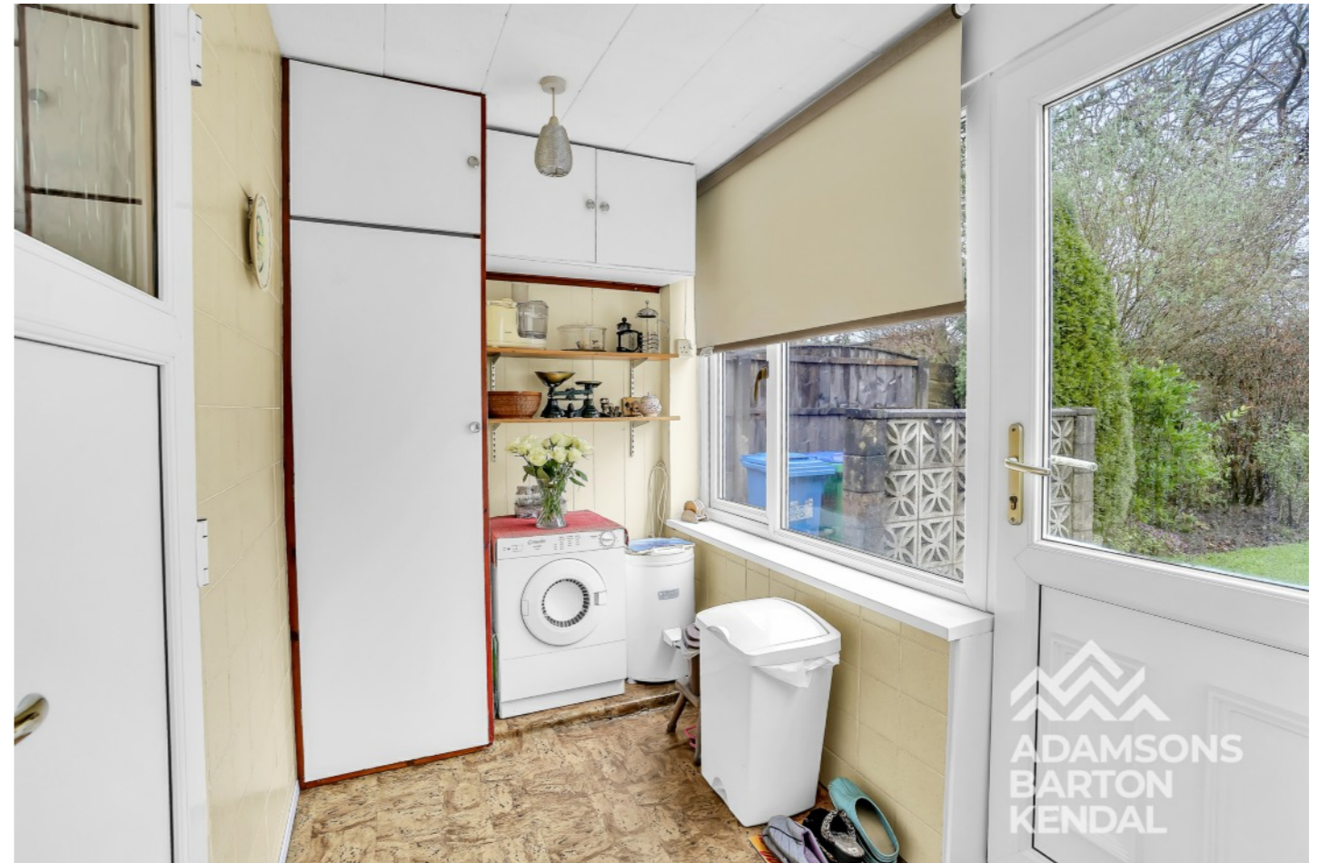
Newhouse Crescent, Norden, Rochdale OL11 5RR