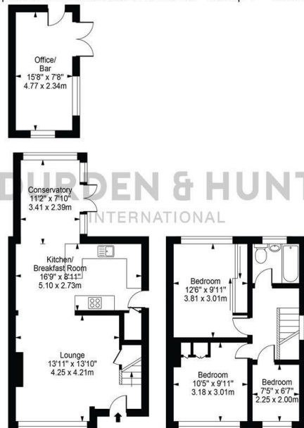
Ground Floor First Floor For Illustration Purposes Only - Not To Scale

Palmerston Road Approx. Total Internal Area 987 Sq Ft - 91.71 Sq M (Including Office/ Bar) Approx. Gross Internal Area Of Office/ Bar 120 Sq Ft - 11.16 Sq M