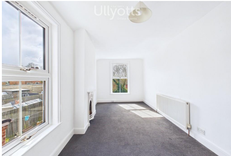
Bedroom 2/Dressing Room