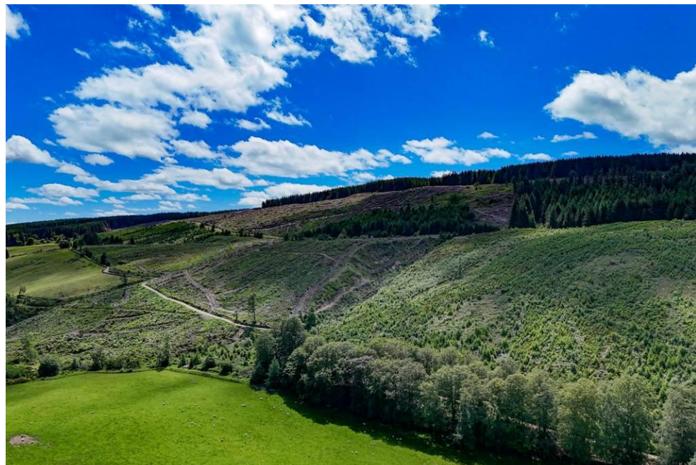
Next Home - Blackcraig Farmhouse , Ballintuim, Blairgowrie, PH10 7PX