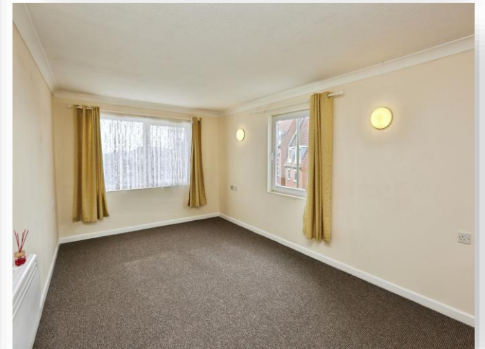
Homeryde House High Street, Lee-On-The-Solent PO13 9JD