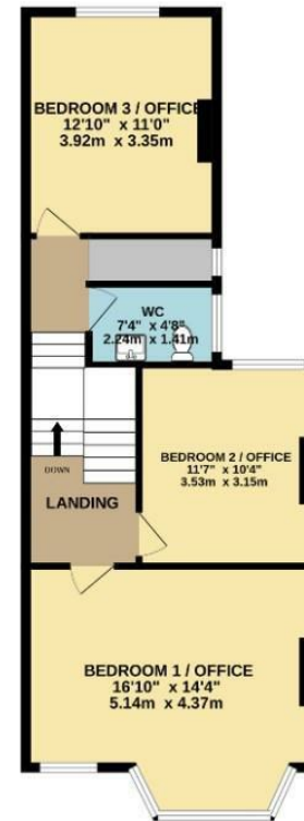
1ST FLOOR 626 sq.ft. (58.1 sq.m.) approx.