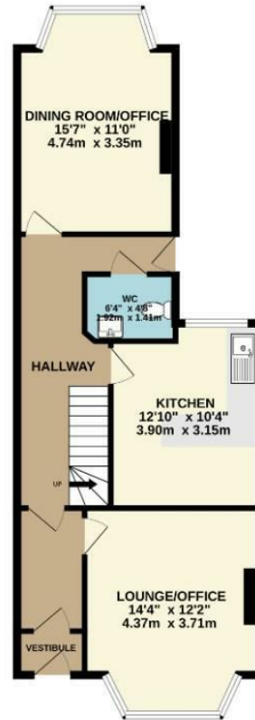
GROUND FLOOR 655 sq.ft. (60.8 sq.m.) approx.