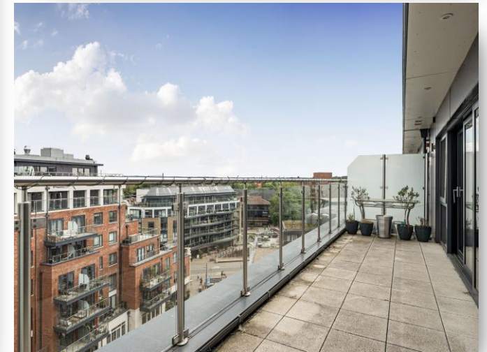
Apartment 80 Waterside Court, The Colonnade, Maidenhead SL6 1DL