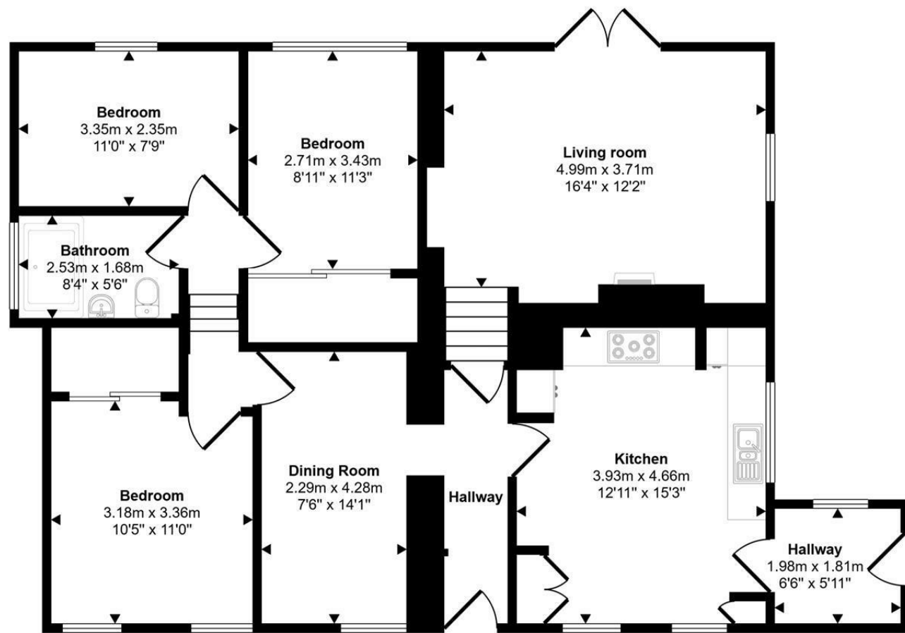
Ground Floor Approx 106 sq m / 1141 sq ft

This floorplan is only for illustrative purposes and is not to scale. Measurements of rooms, doors, windows, and any items are approximate and no responsibility is taken for any error, omission or mis-statement. Icons of items such as bathroom suites are representations only and may not look like the real items. Made with Made Snappy 360.