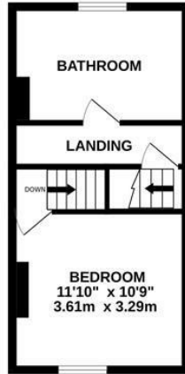
1ST FLOOR 287 sq.ft. (26.6 sq.m.) approx.