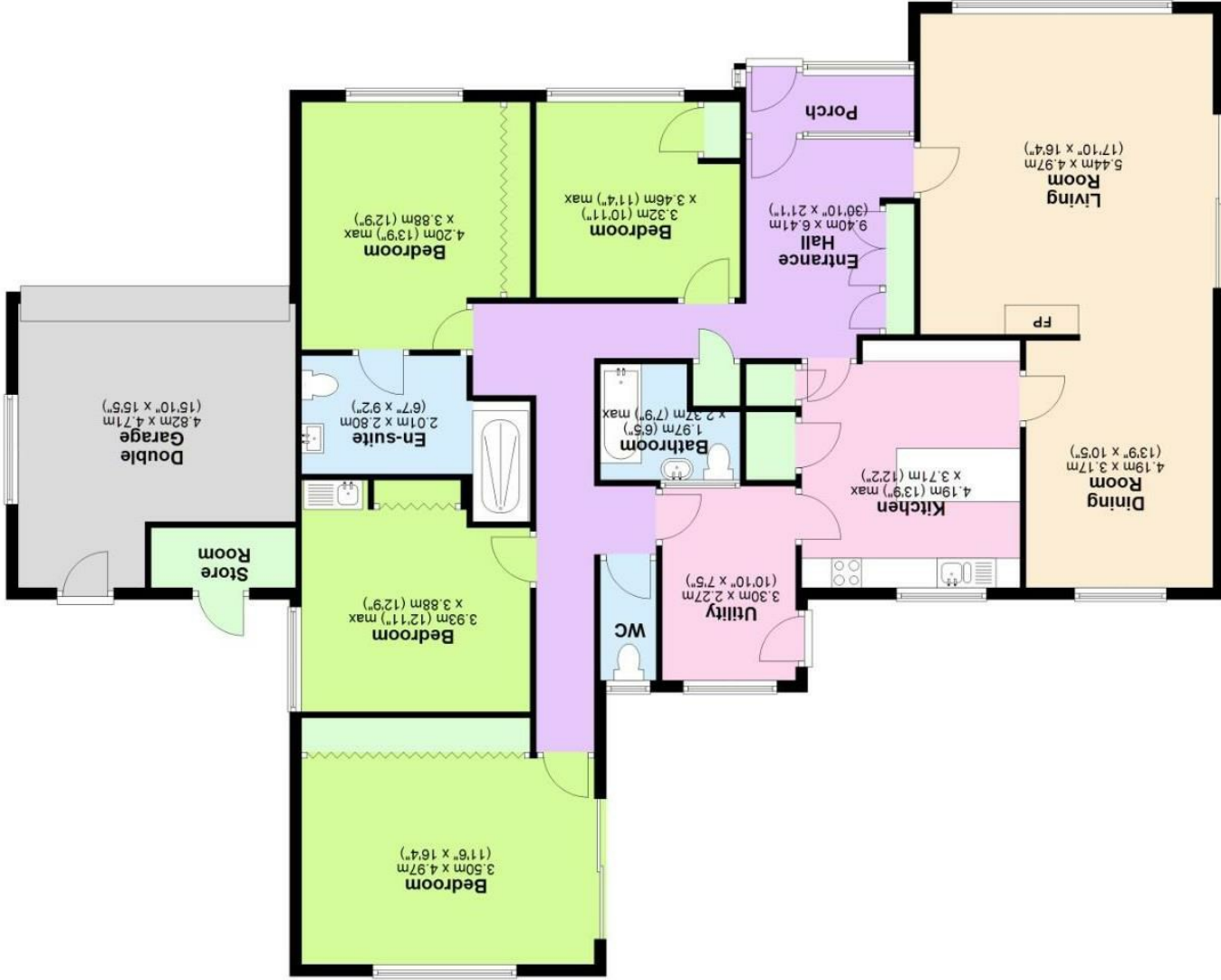
Total area: approx. 196.4 sq. metres (2114.1 sq. feet)