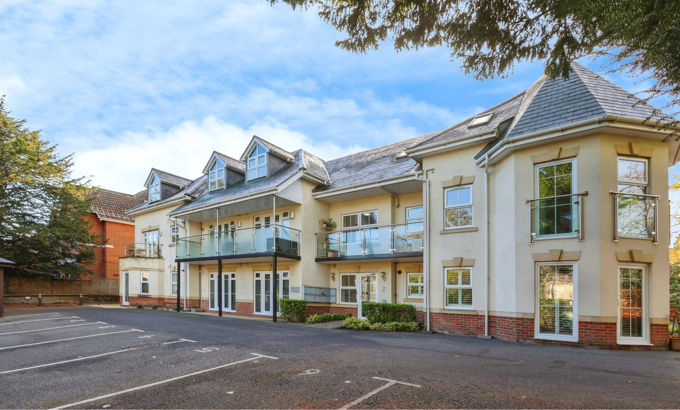
Surrey House Surrey Road, BOURNEMOUTH BH2 6BS