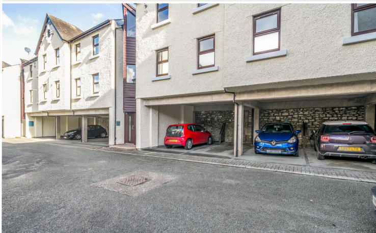
Undercover allocated parking space