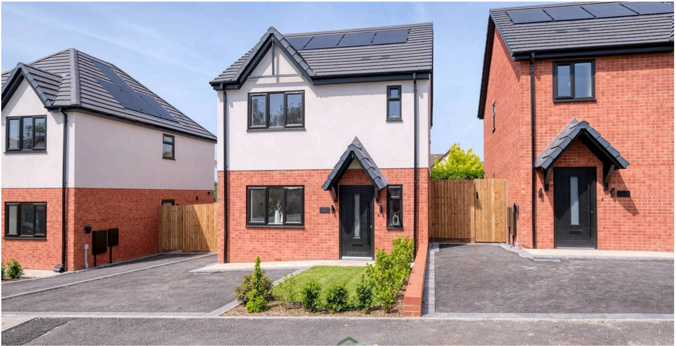
The Chestnut Ailstone Mews, Lickey End Bromsgrove