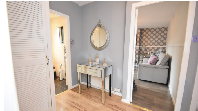
3 Eldrick Crescent