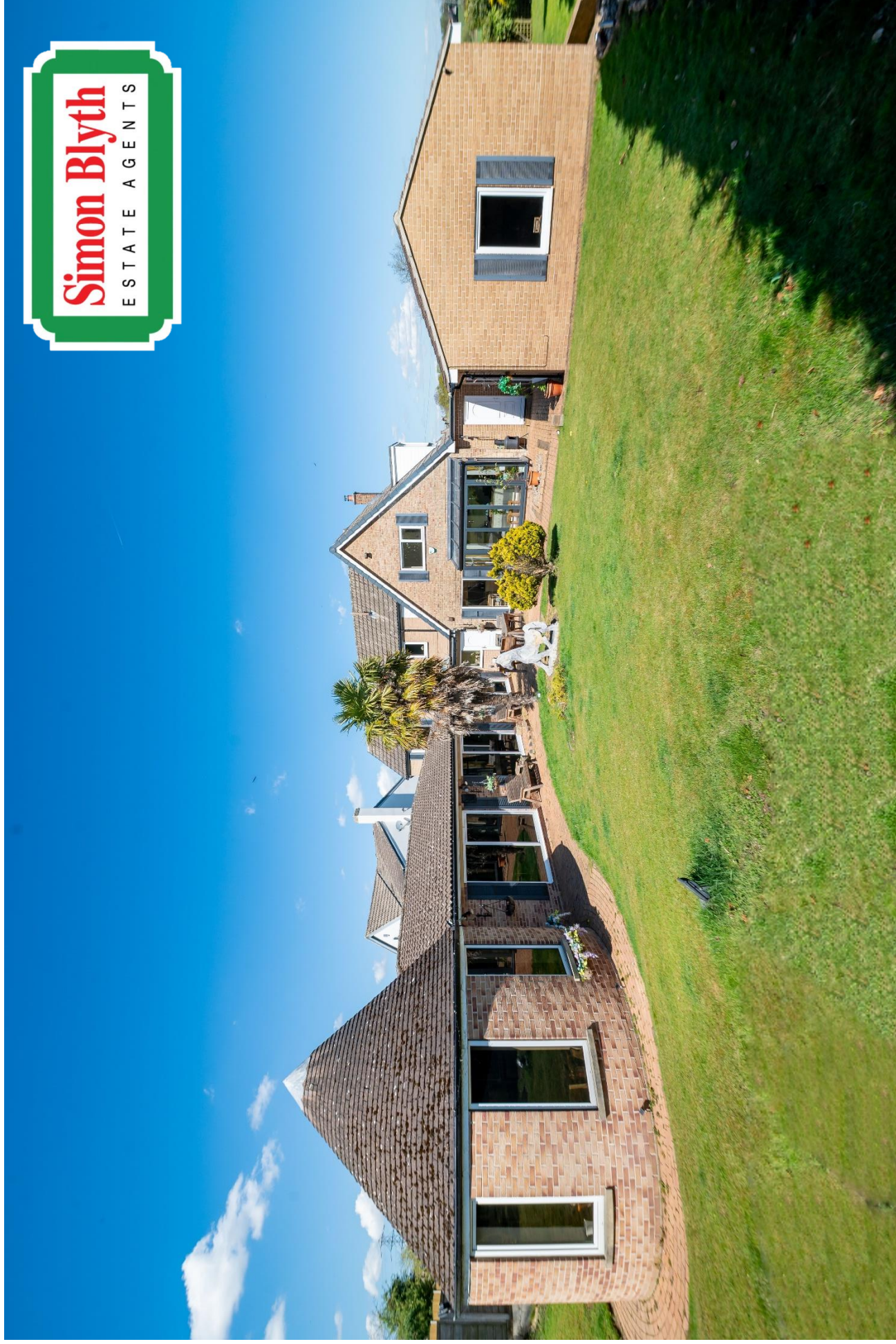
OAK VIEW, 24 WALTON STATION LANE, WF2 6HP