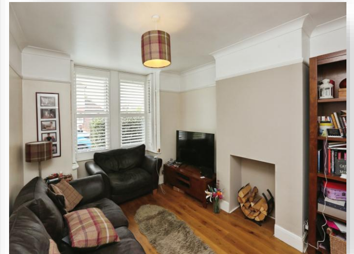
Bay Road, Gosport PO12 2QA