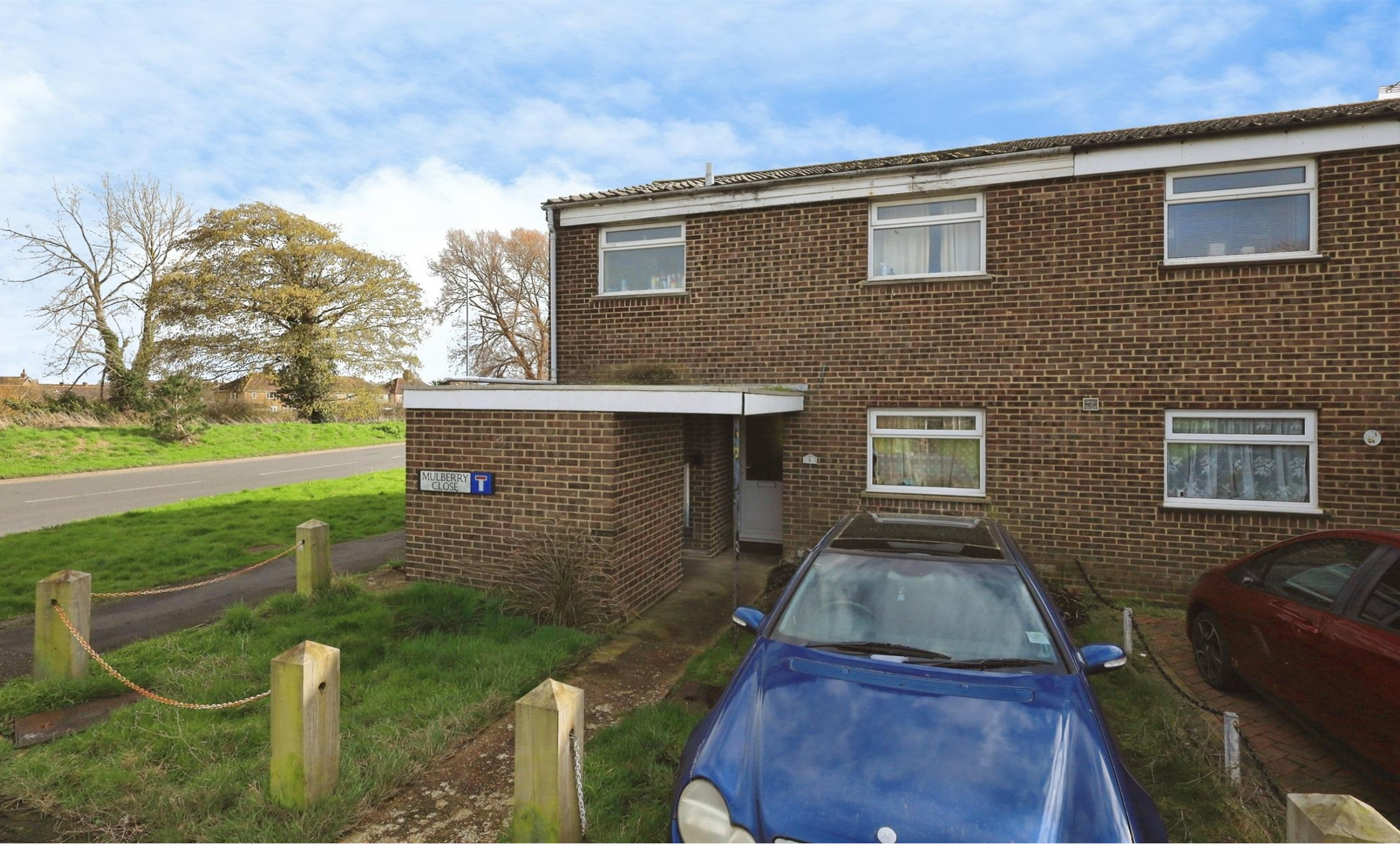
Mulberry Close, Eastbourne BN22 0TU