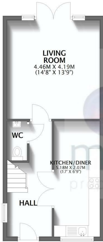
GROUND FLOOR APPROX. 40.8 SQ. METRES (439.3 SQ. FEET)