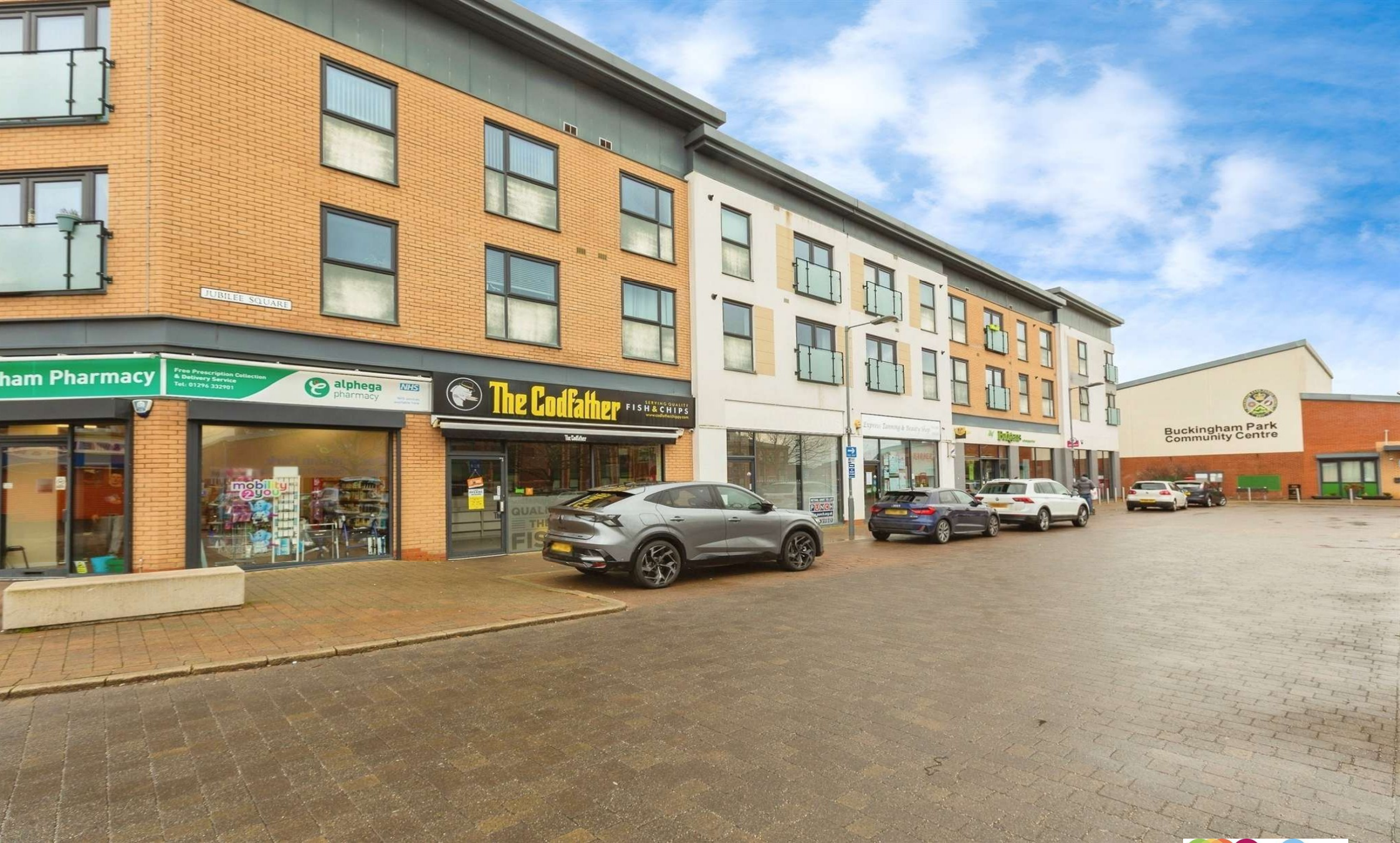
Jubilee Square, Aylesbury HP19 9DZ