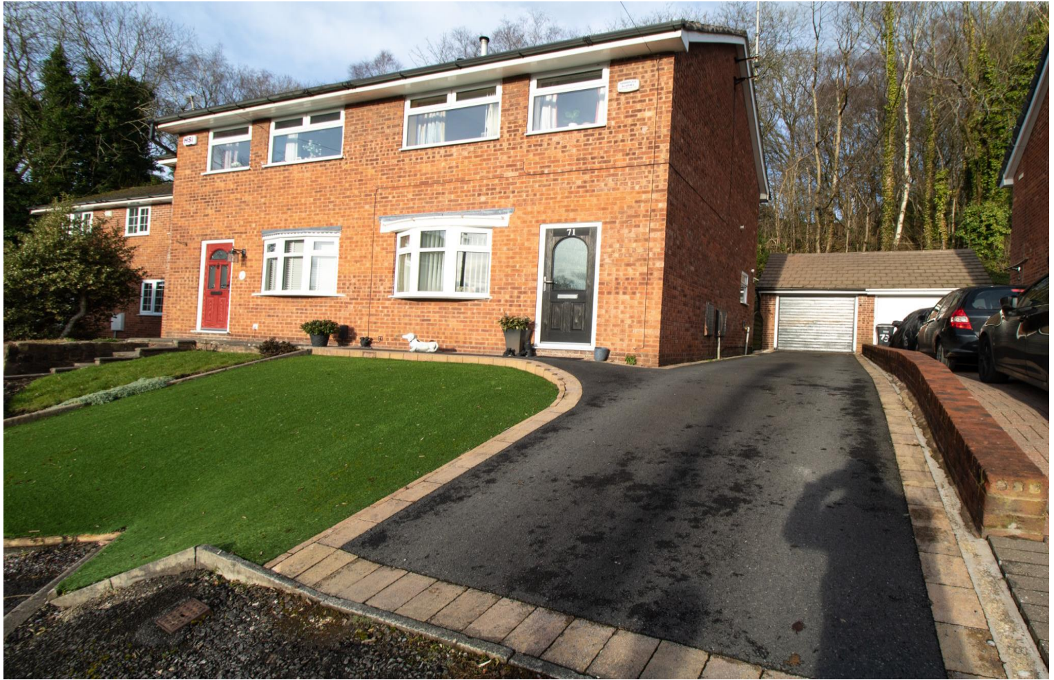
Riverside Drive, Stoneclough, Radcliffe, M26 1HU