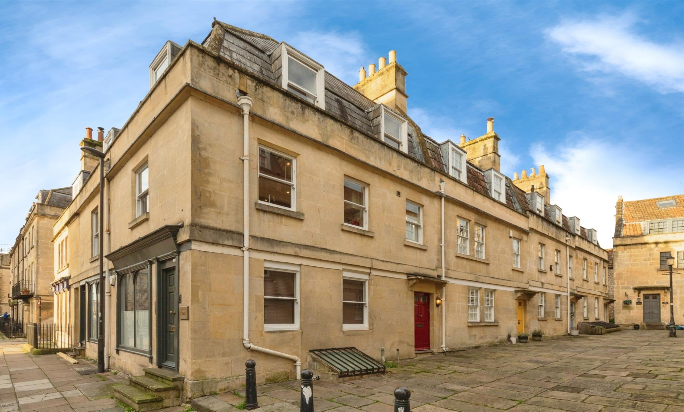
St. Anns Place, Bath BA1 2BJ