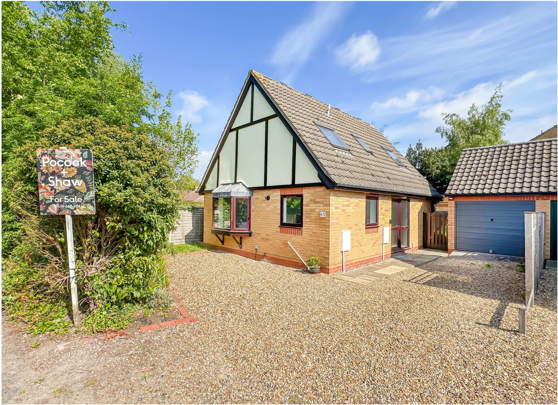
Toyse Lane, Burwell, Cambridgeshire