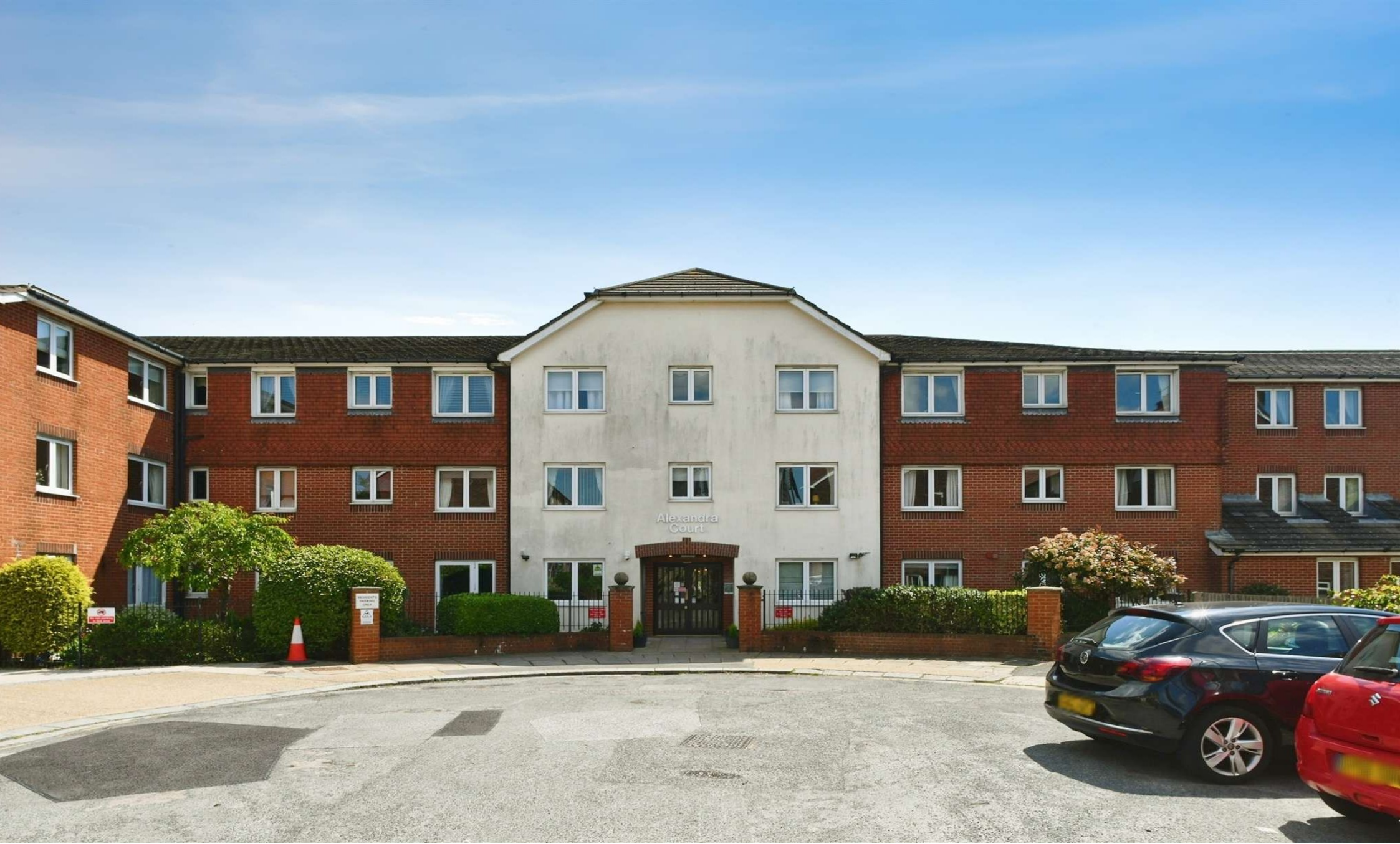
Alexandra Court St. Peters Close, Hove BN3 7RF