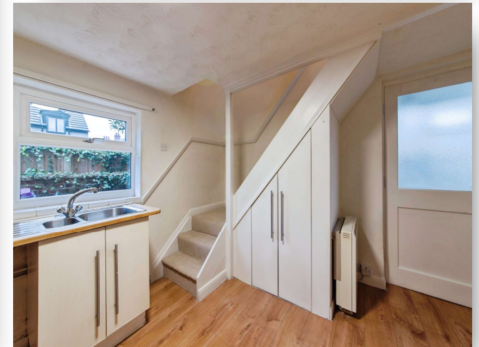
School Lane, Helpringham Sleaford NG34 0RG