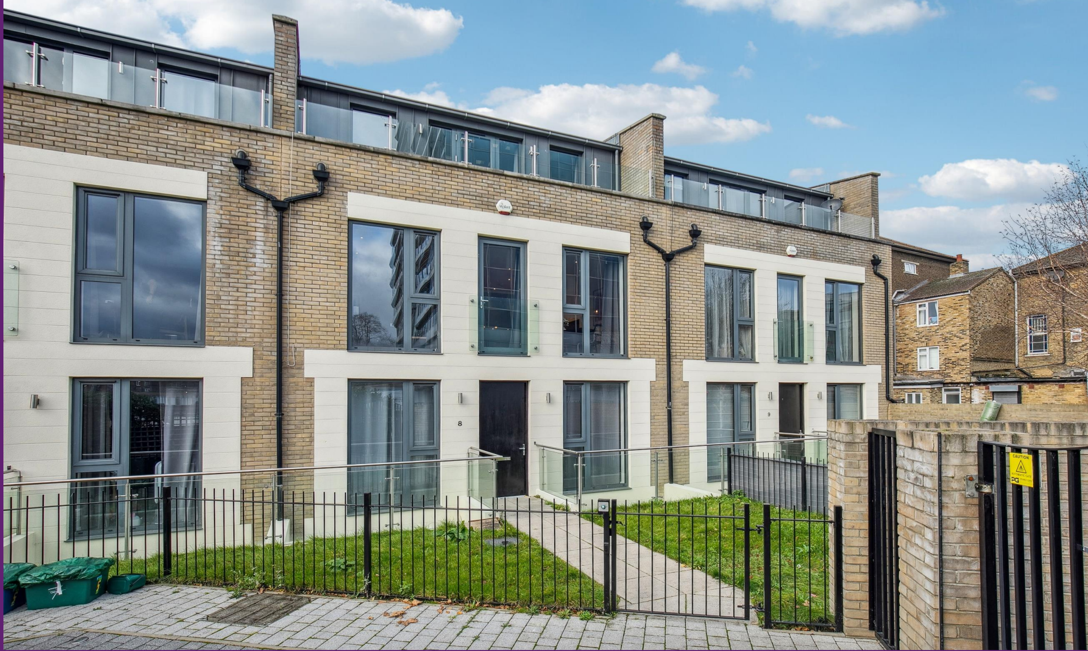
Gunnersbury Mews London, W4