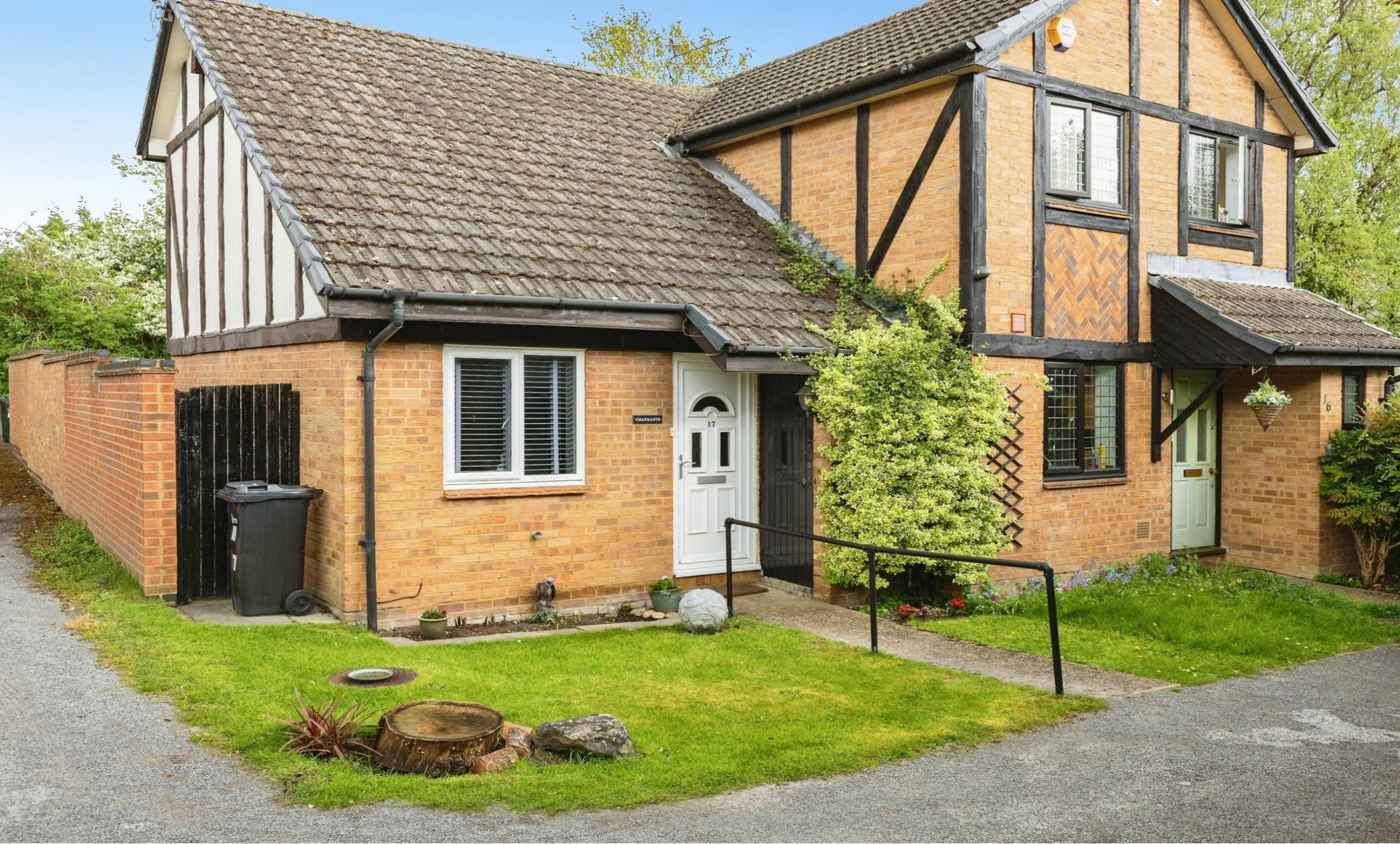
Ratby Close, Lower Earley Reading RG6 4ER