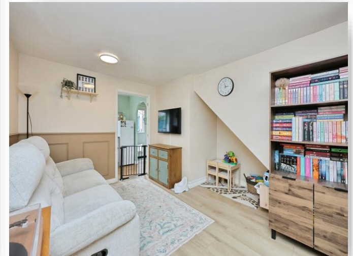
Rose Avenue, Costessey, Norwich, NR8 5EX