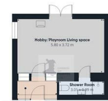
Floor 0 Building 3