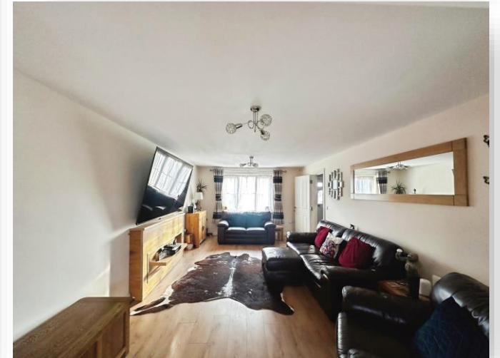
Cotswold Close, CORBY NN18 8GN