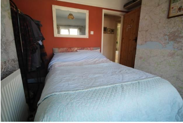
BEDROOM 3: 11'(max) x 8'(max) (3.35m x 2.44m) Radiator and double glazed window. Built in bed with storage.