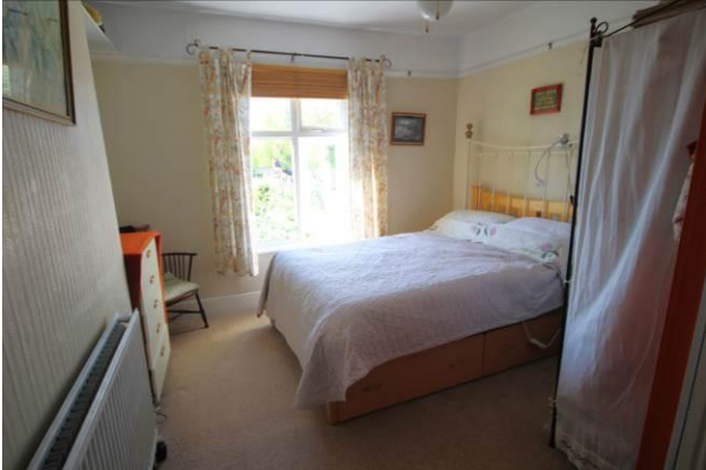
BEDROOM 2: 11' x 11'(max) (3.35m x 3.35m) Radiator and double glazed window.