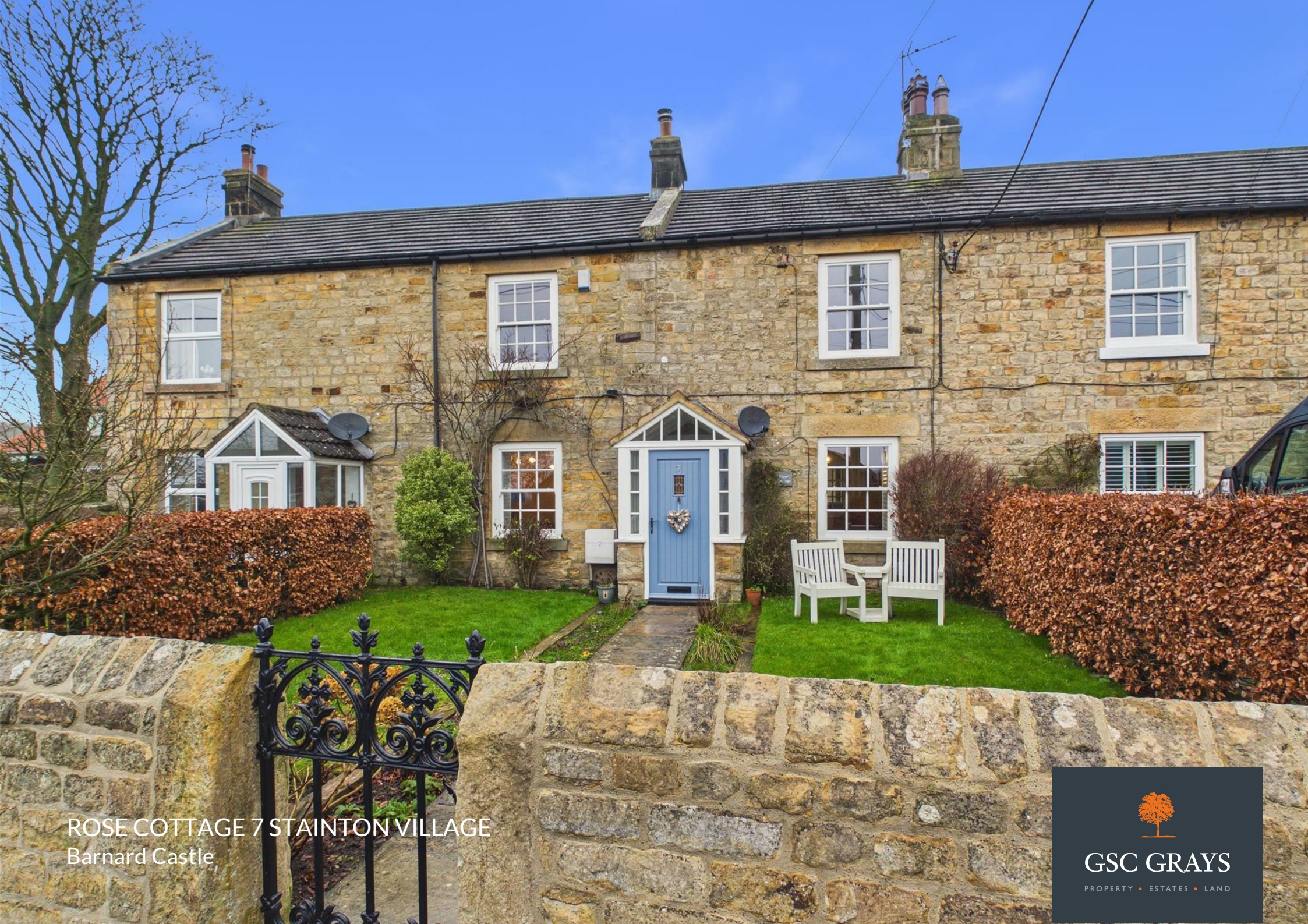
ROSE COTTAGE 7 STANTON VILLAGE Barnard Castle