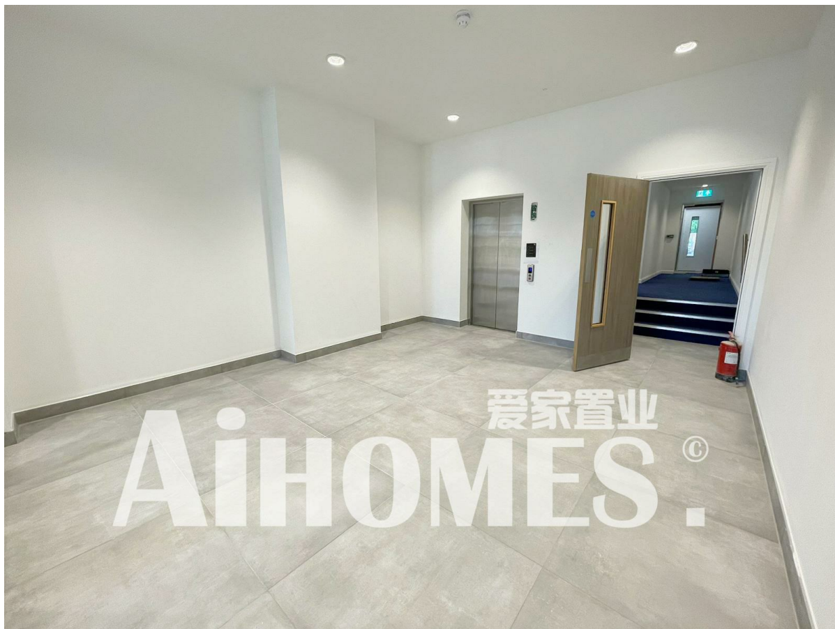
Modern 2B2B Apartment | Valiant House | Altrincham WA14 1VH 73730