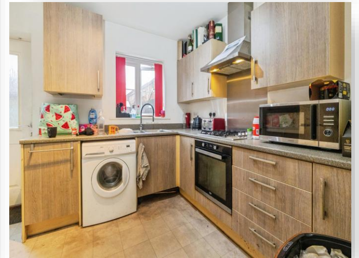
Iris Crescent, Lincoln LN1 1AZ