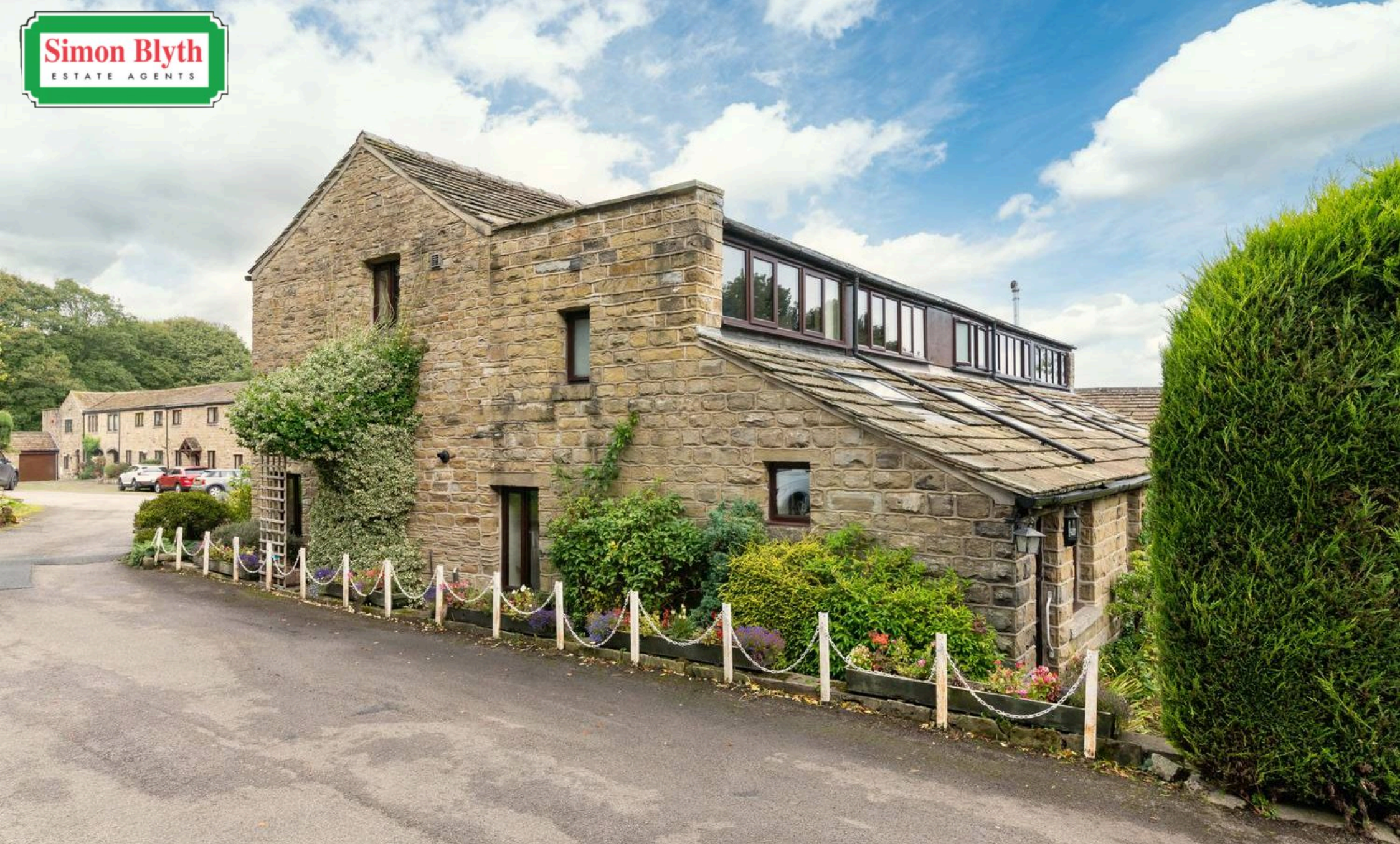
Highfield Court, Shepley Huddersfield, HD8 8BG