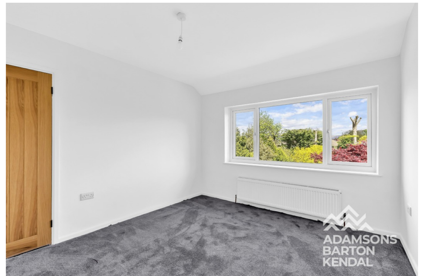
Craiglands, Rochdale OL16 4RD