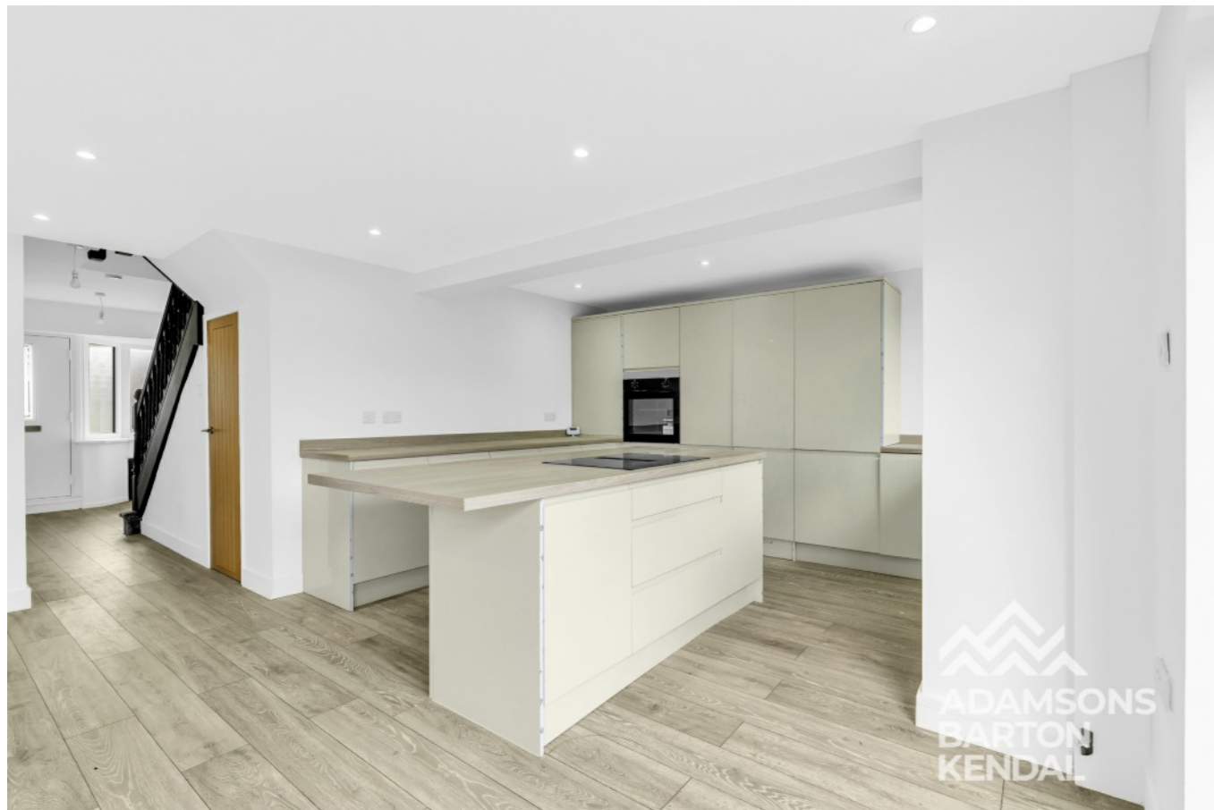
Craiglands, Rochdale OL16 4RD