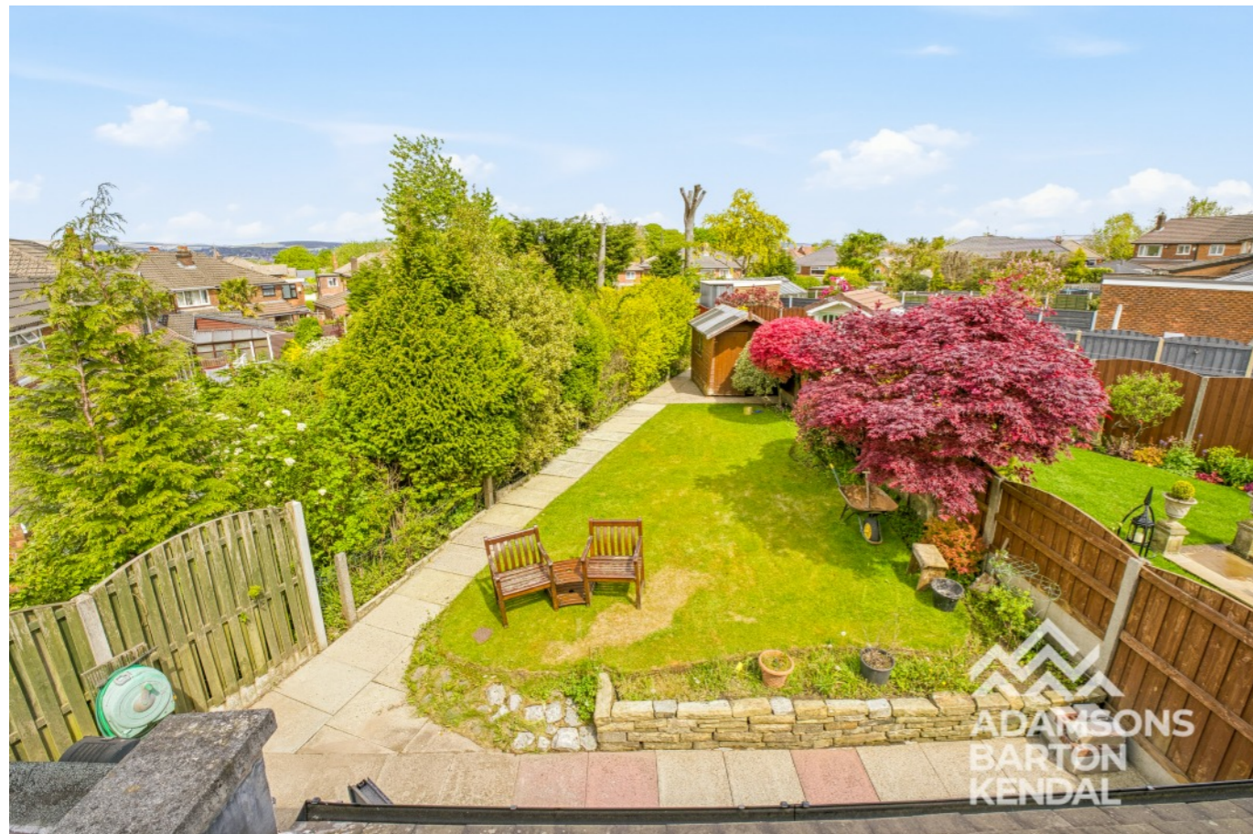
Craiglands, Rochdale OL16 4RD