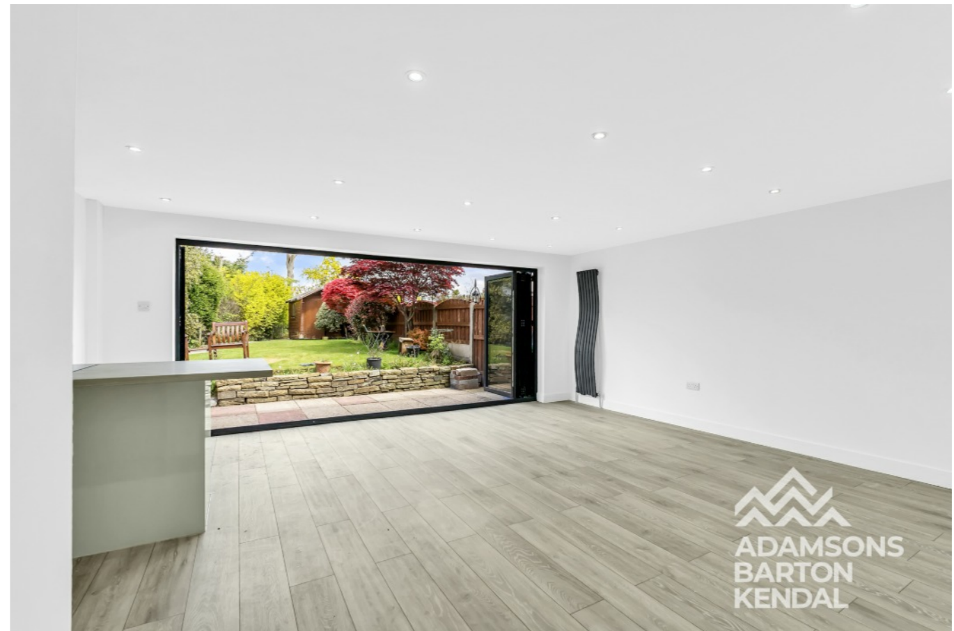
Craiglands, Rochdale OL16 4RD