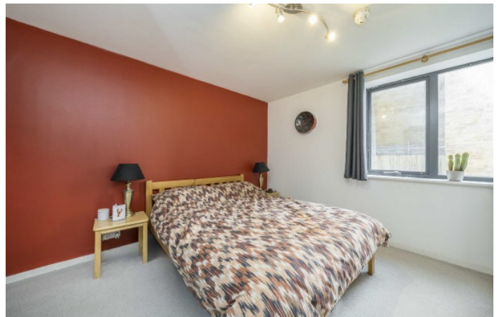
Kipling Street, SE1