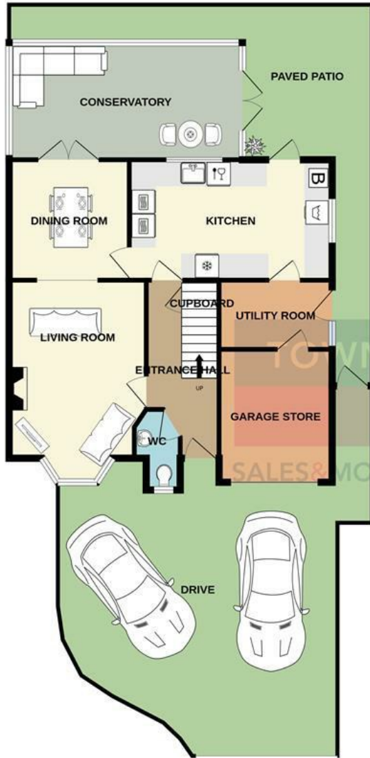
GROUND FLOOR 853 sq.ft. (79.2 sq.m.) approx.