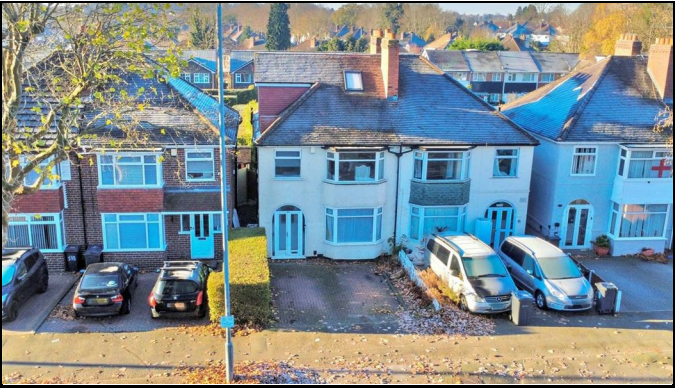
Holly Lane, Erdington, B24 9LA