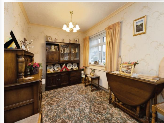
Boston Drive, Marton-In-Cleveland Middlesbrough TS7 8LZ